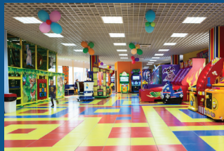
KIDS FUN CITY